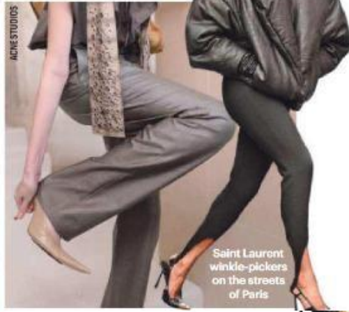
Saint Laurent winkle-pickers on the streets of Paris