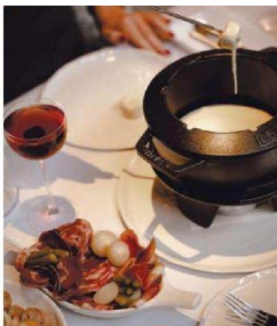
Cheese fondue, above, at the Chalet, Rosewood London